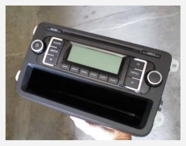
Here I've completely removed the car radio in order to check the input at the back of it.