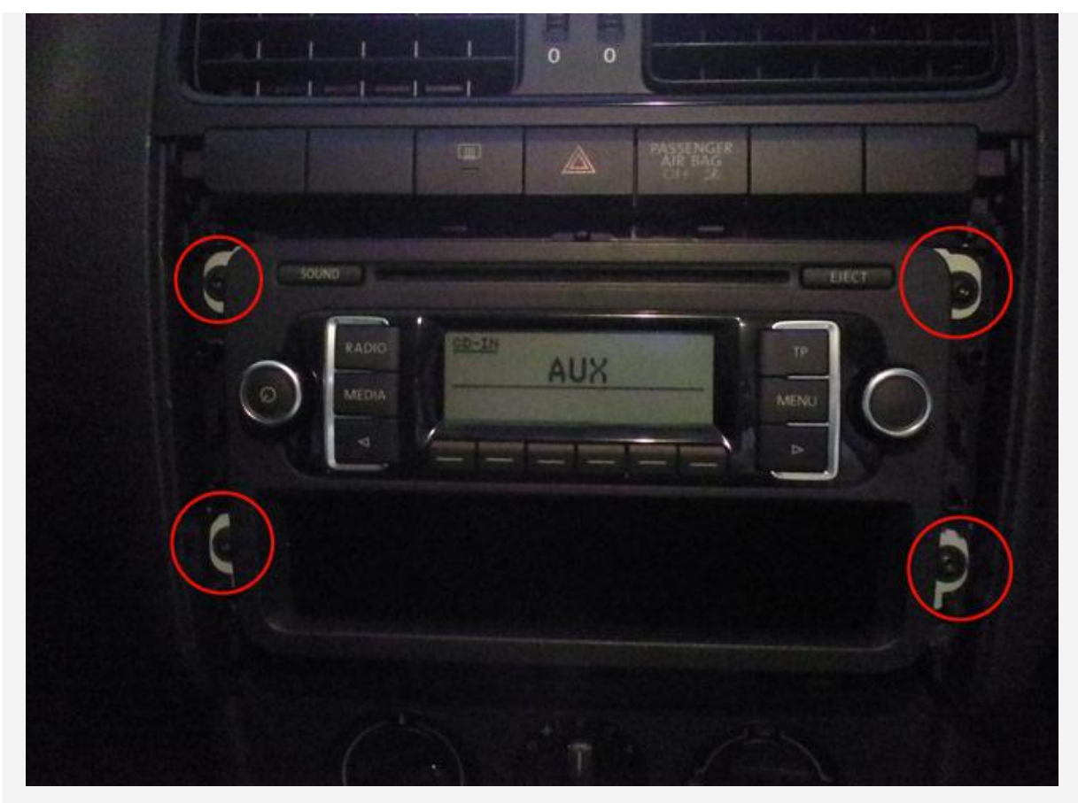
Theses screws can be easily removed with a Torx-Screwdriver (10)

Now the rest is pretty straight forward: take a Torx (T10) screwdriver and open the four screws: hurray you have extracted your car radio