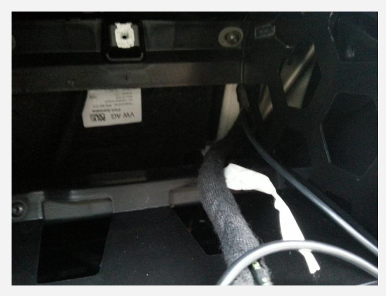
Now you can put the cable along the big Quadlock cable. You can push the cable till it comes out on the bottom of the central console.

You must remove the white block in order to plug it correctly and without having to disconnect the Quadlock.