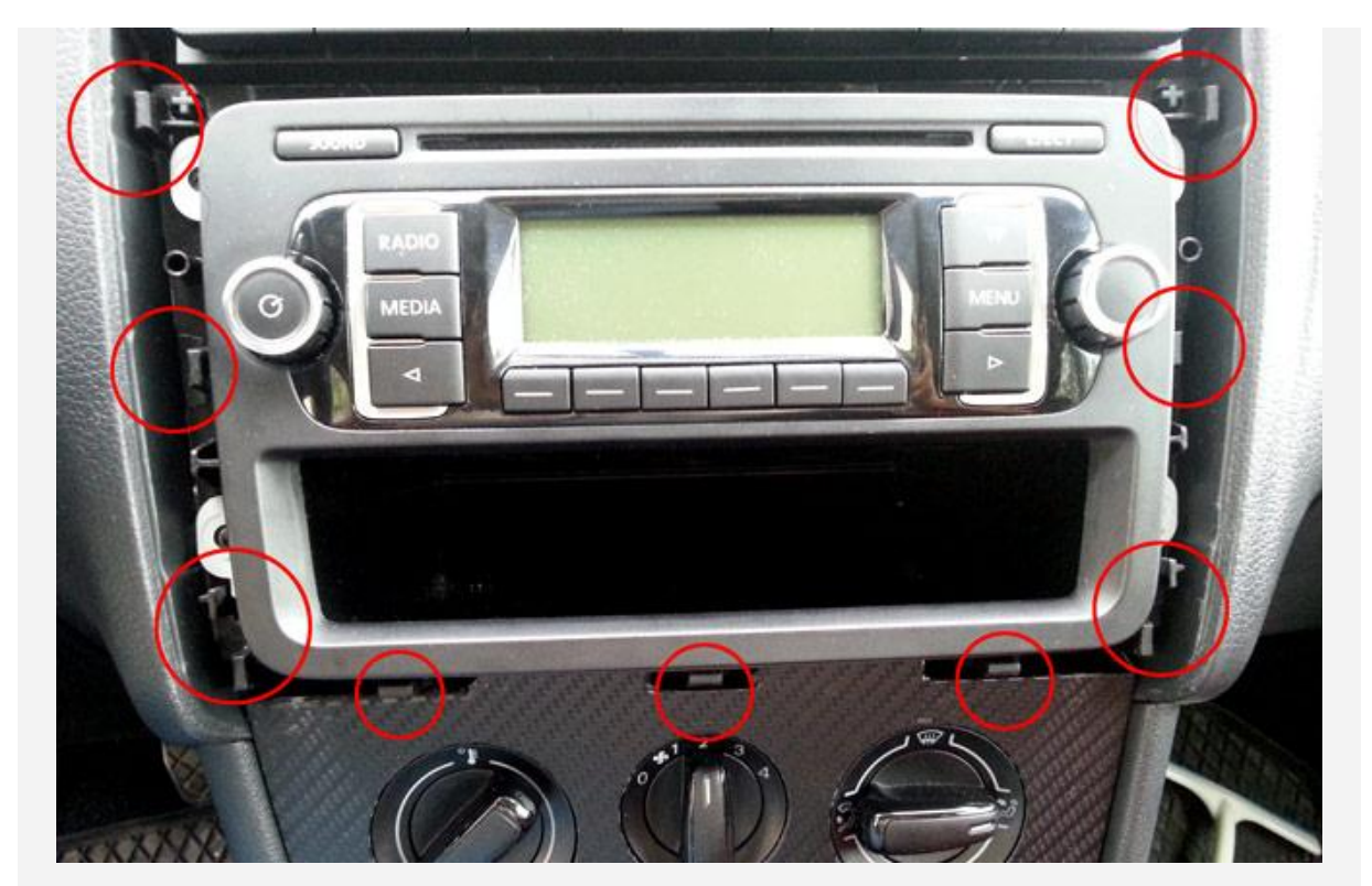
Front view of the car radio with the plastic frame removed. Notice the placement of the clips. The three on the buttons are not very strong, so be careful when you unclips them.

Be very careful because depending on the quality of your plastic cards you may damage (ok, ok it's not really damaging) but you will notice small traces around the frame.