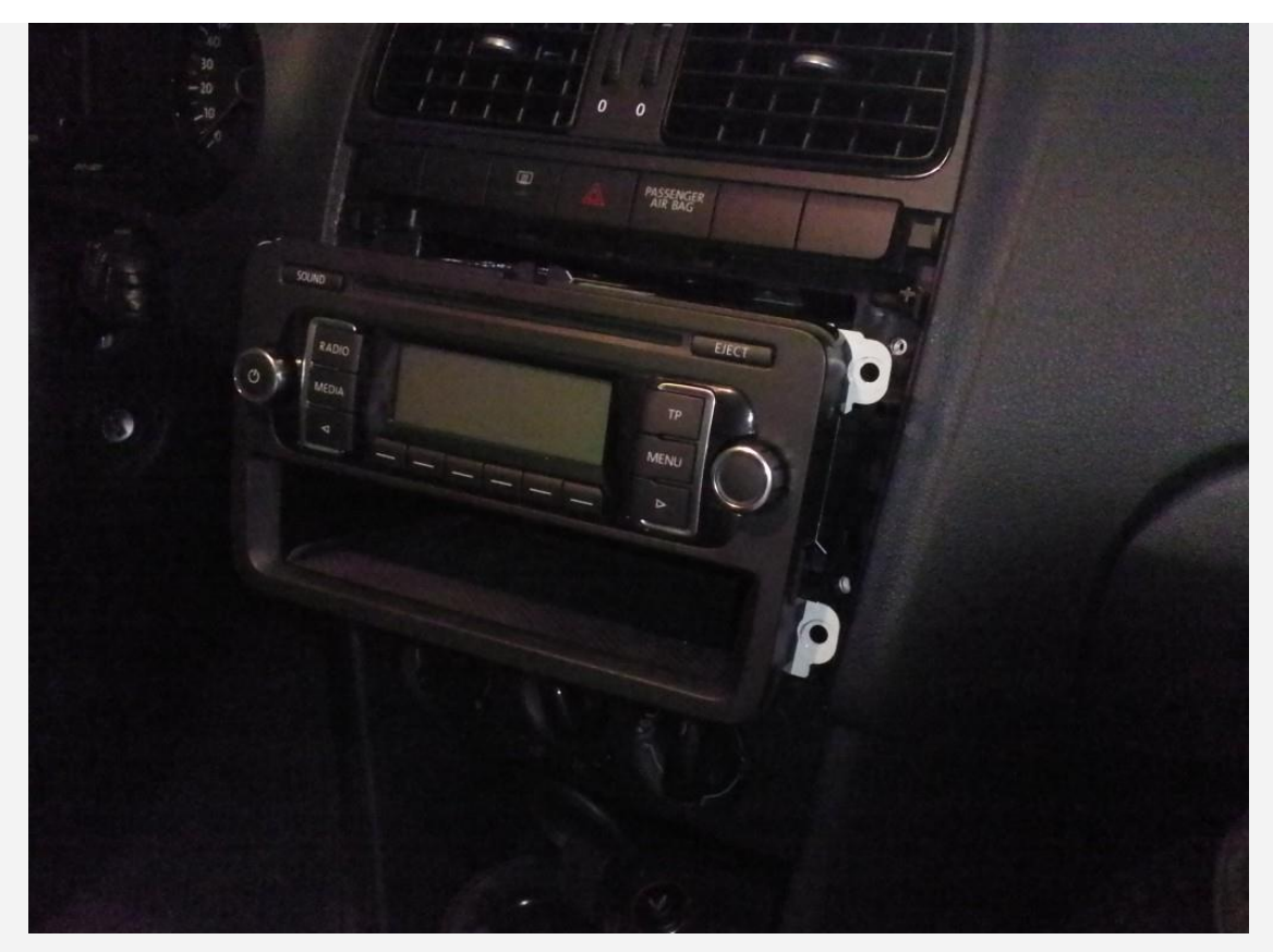
The extracted car radio.